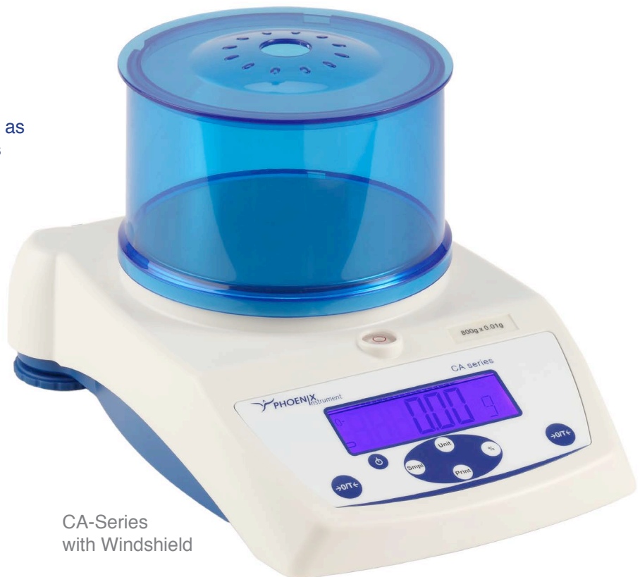
CA-Series with Windshield