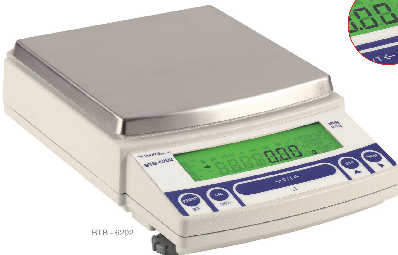
BTB - 6202